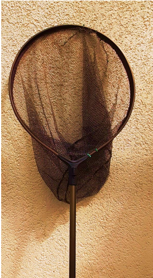
Fig.1. Net for fishing with a wide dark rim, a deep bag and a folding handle.