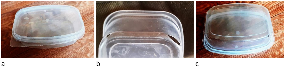
Fig.9. Plastic disposable box (a) and cutting off 4 corners (b) of its bottom (c).

ranavirus etc.) transfer between individuals. If necessary, frogs of the same size can be stored together for a short time. The number of frogs in one box depends on their size: they should occupy no more than a third of the area of the box. When storing small juveniles, wet soft plants from the same pond should be placed in the boxes.